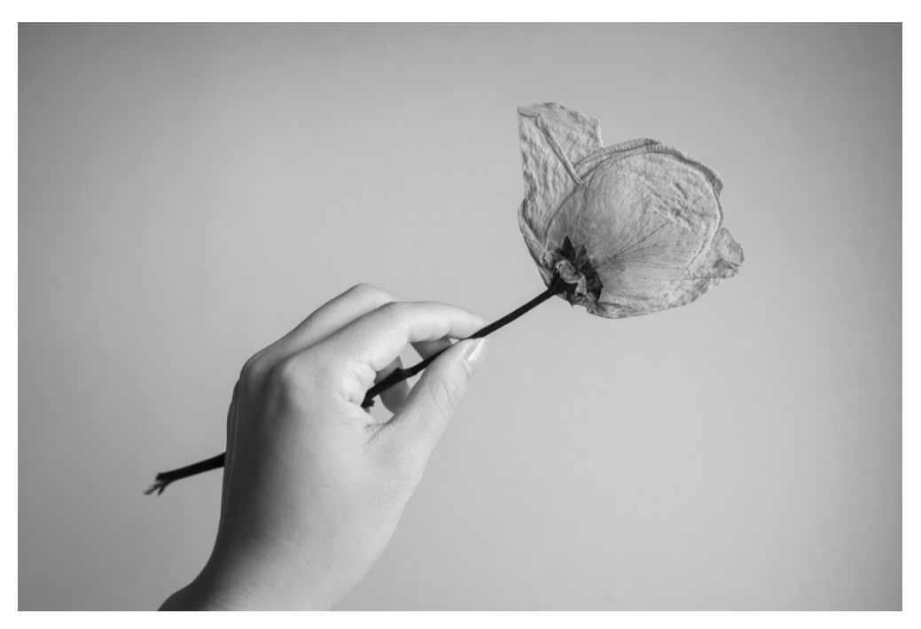
Uehara Sayaka, Old Woman Selling Flowers , 2024 Set of 4 archival pigment prints and printed text on a newsprint paper Image size 34 x 51cm each, sheet size 42 x 59.4cm each, and 41.4 x 29.4 cm

Opening Reception: Saturday, April 13, 16:00-19:00