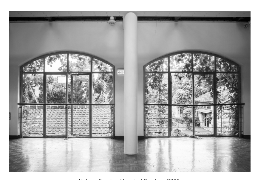
Uehara\ Sayaka,\ \textit{Haunted Gardens},\ 2023 Set of 6 archival pigment prints and printed text on a newsprint paper Image size 34 x 51cm each, sheet size 42 x 59.4cm each, and 41.4 x 29.4 cm

In addition to Haunted Gardens from the Green Rooms series, which was awarded the Encouragement Prize and the Ohara Museum of Art Prize at the VOCA (The Vision of Contemporary Art) 2024 exhibition, a new work, Old Woman Selling Flowers , will be on display for the first time.