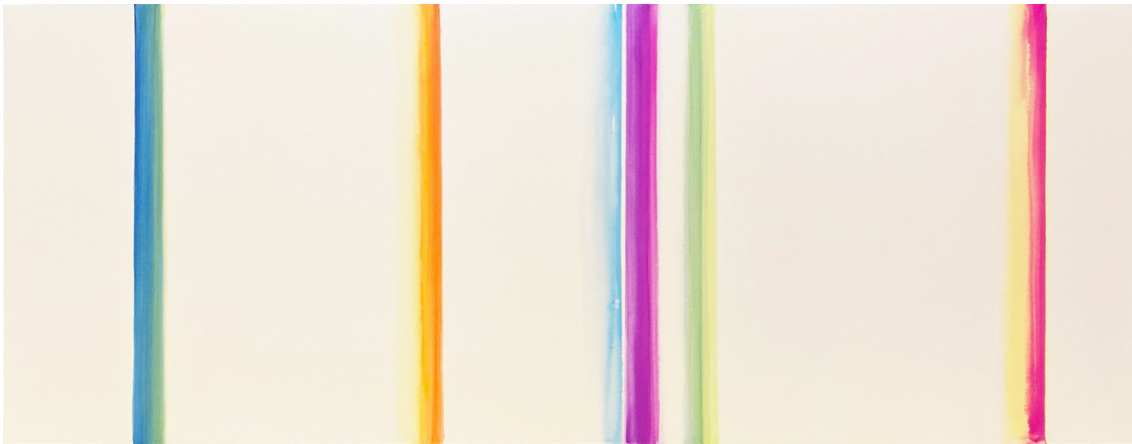
Shingo Francis, Spectral Visions I , 2023, acrylic on paper mounted on panel, 155 x 60 cm

Hours: Tuesday-Saturday 12:00-19:00 (Closed on Mon, Sun, Public holidays)