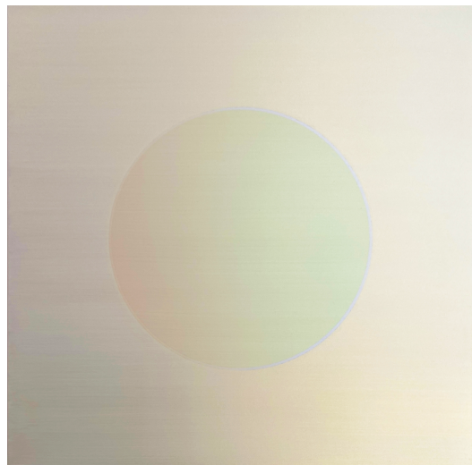
Illumination (emerald-yellow) 2021, oil on canvas, 53 x 53cm

In classical times, the circle expressed the world as a whole, including the five elements of earth, water, fire, air, and aether. In Zen Buddhism, the circle represents enlightenment or truth, and is said to reflect the mind of someone who has seen the truth. The circle can be found in the shinkyo , or sacred mirrors of Shinto, and in Zen circle calligraphy. It is simple and clear, but it may be the most difficult shape to grasp. The circle also refers to Nature's repetition and change where we live out our lives in this grand scheme of cycles. These new experiments by Francis bring the viewer face-to-face with his or her own reflection, inviting and facilitating introspection.