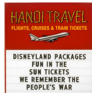
Hanoi Travel, 2000