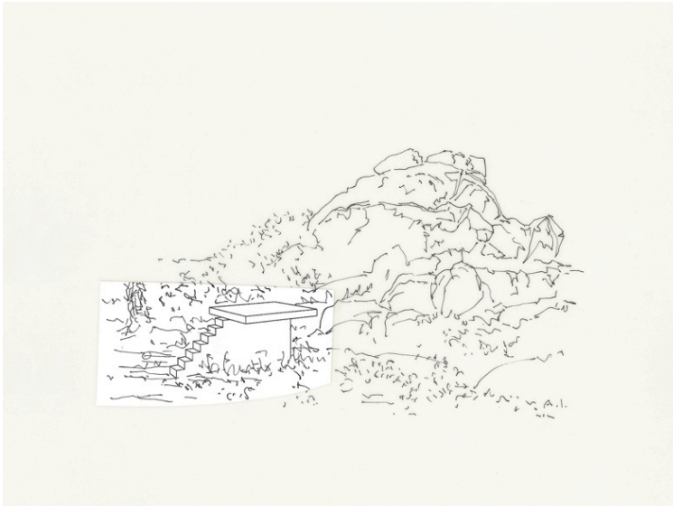
Obscured Horizon Ink on tracing paper

Opening Reception: Friday January 24 18:00 - 20:00