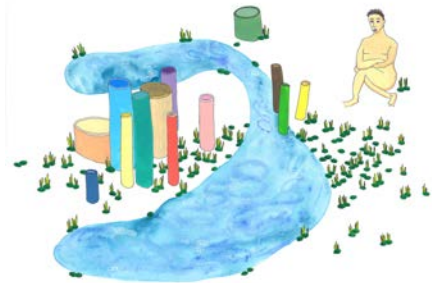
Shinoda Taro, Untitled , 2020, Ink, watercolor on paper, 28 x 37.5 cm

Shinoda Taro is mainly known as a creator of sculpture, videos, and installations, but he has also produced watercolors since the beginning of his career. The works feature plans and ideas for art projects, fragments of the artist's memories, things that captured his curiosity, together with a naked man who could be the artist himself. Drawings produced with fresh colors and delicate lines under the constraints of life during the pandemic present a range of questions as a response to an uncertain future.