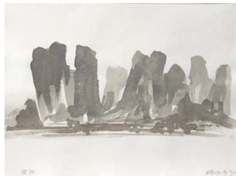
Isozaki Arata, Guilin , 1997, Watercolor on paper, 31.5 x 40.5cm

For architect Isozaki Arata, a drawing, whether it is a sketch of an idea for architecture or a record of his travels, is the initial product of his thought processes. Nanjing Urban Planning is an architectural curation project in which several architects and artists appointed by Isozaki designed the individual architecture of the city, reflecting his unique approach of freeing architecture and cities from their conventional frameworks, and instead interpreting them in the context of art. The show also presents a watercolor of rugged karst hills that bring to mind the skyscrapers of Manhattan, which the architect painted on a boat on his first trip to Guilin, China in 1997.