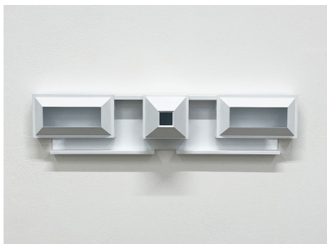
Isozaki Arata, Derivation of Art Tower Mito , 2019, Model of 3D Printing FDM System, Plastic, 55.5 × 44.2 × 8.7cm

Beginning from the completed form of architecture and going backward to extract fundamental concepts reveals abstract forms such as the cubes of the Museum of Modern Art, Gunma, the cylinders and semicylinders seen in the Kitakyushu Central Library and Kamioka Town Hall, the cuboids of the Kitakyushu City Museum of Art, and the regular tetrahedrons of Art Tower Mito. Isozaki's Reduction series shaves off elements that were added to the architecture during the design process or after completion, including three-dimensional internal spaces, experiences and views that only come to life through the intervention of human actors, and interactions with the surrounding