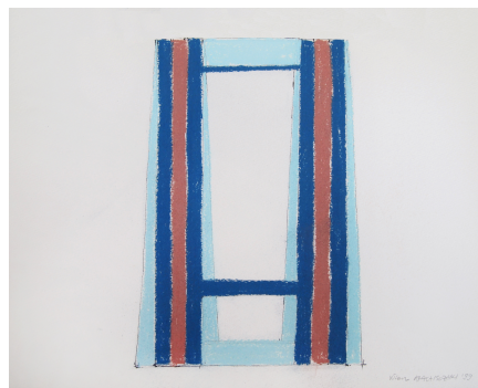
Isozaki Arata, Wien , 1999, Pastel on paper, 31.5 × 40.5 cm

In addition to architecture, during a career spanning more than half a century, Arata Isozaki has explored and applied his creativity to areas such as theory, art, design, and theater, transcending genres and periods. This exhibition gives a glance at both the spirit behind his work and some of the forms that it can take.