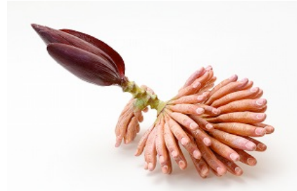
Suhasini KEJRIWAL Untitled 2008

Suhasini KEJRIWAL creates works, which one might describe fictional plants or creatures with vivid colors. The work, which will be exhibited attracts the viewer's eyes to the details for the first sight. Gradually the viewer would experience the awakening of a deeply hidden unconsciousness. A sculpture of a bunch human fingers, together with the deep red flower petals on the top, the work rouses the concept beyond good and evil, people's greed and eroticism.