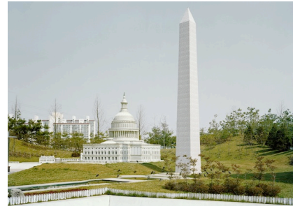
BACK Seung Woo Real World I - #042 2006

BACK Seung Woo's "Real World I" is a set of photographs taken in the theme park in South Korea. They are straight photographs taken with a technique, which is commonly used for architectural photographs. However the unrealistic world created by miniature architecture in the photographs might be disturbing for the eyes of the viewer. What represented in the work is not the longing for foreign countries or culture, but it is a fantasy where reality and unreality has a vague border in between.