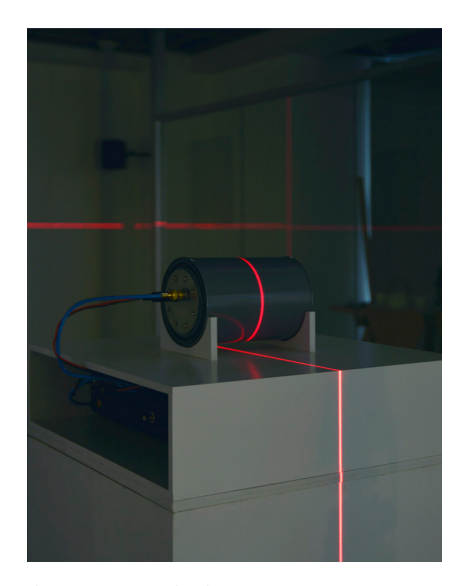
Shimizu Jio + Hiroyuki lida, Decay music , 2017, Mixed media installation, Dimensions variable. Installation view at "Threshold", Art Gallery Miyauchi, Hiroshima.

The two light-emitting panels, in conjunction with the space between them, form a triptych that adheres to the size and format of Hieronymus Bosch's triptych The Garden of Earthly Delights , a distinctively demarcated from other Flemish Primitives of the same period. Even today, people debate the interpretation of The Garden of Earthly Delights , which despite being an altarpiece, portrays in detail the temptations of pleasure and the folly of humanity. The arrangement of the panels links window 's keywords "light" and "darkness" to Bosch's themes of heaven and hell, suggesting that human behavior and foolishness are monitored, and eventually lead to a central void.