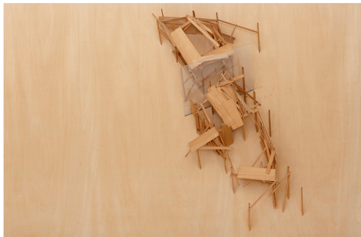
KAWAMATA Tadashi, Favela in Battery Park City N.Y. , 1988

installation, and disassembly. Kawamata's projects are continually changing and progressing, encompassing collaboration with individuals who are dealing with social problems, such as the unemployed and drug users, examining and constructing relationships between the significance of cities and the people who live in them, such as in the case of people living in former coal mine districts, as well as integrating architecture and urban planning, history and sociology, everyday communication, and human memory and psychology. In addition to embodying the work-in-progress concept that sees his work as unfinished and provisional, the artist considers each project to incorporate all the processes involved –including the actions and processes of the participants, as well as each drawing and model produced in the course of implementing the project.