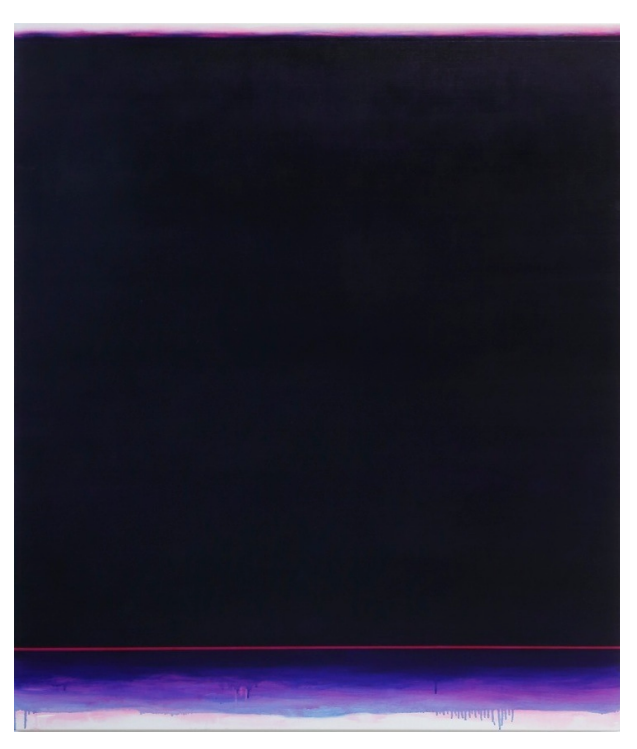
Veil (red) 2014 Oil on linen

His most well-known work, a series of paintings in deep blue monochrome, entails a rich spirituality. The pitch-black Francis' of signature quality monochrome series, which has an entrancing effect upon the viewer, is created by applying multiple layers of paint which are in fact blue in color. The artist's repetitive application of paint is observable upon close inspection. In Bound for Eternity. painting resembling a strip of light, the monochrome coloring emits a liberating tone, bringing a sense of calm to the viewers' heart.