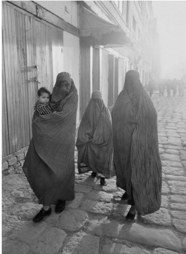
TOMATSU Shomei, Afghanistan , 1963/2009

In August 1963, Tomatsu visited Afghanistan as a correspondent of the magazine Taiyo , published by Heibonsha. Both his first trip abroad as well as his first trip to Afghanistan, for the thirty-two year old Tomatsu, the experience was a series of surprises—the white parched landscape and intense sunlight, the lifestyles of the nomads who had no permanent homes, the people who gathered at the bazaars, and the women wearing the chadri (burqa).