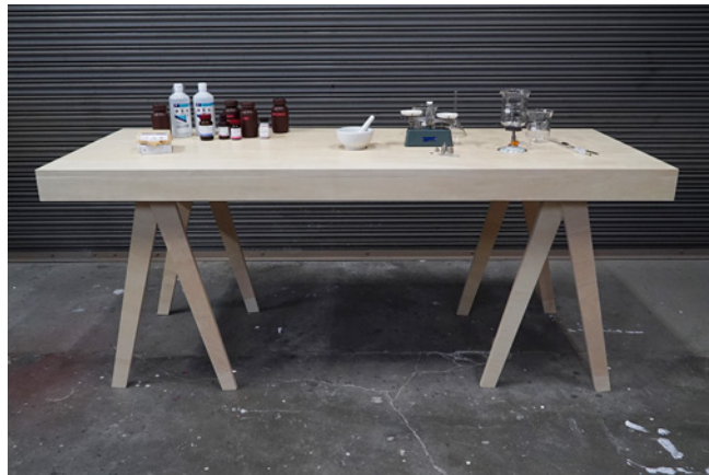
SHINODA Taro, The Sun and Mt. Fuji and Steve Reich , 2016 Mixed media, 180 x 70 x 94 cm (70.9 x 25.5 x 37 in)

Visitors to 'The Sun and Mt. Fuji and Steve Reich,' are invited to observe the traces of the process whereby elements that appear naturally on the earth's surface—such as light from the sun, minerals of the earth, vibration of sound—are transformed through chemical reaction into different substances.