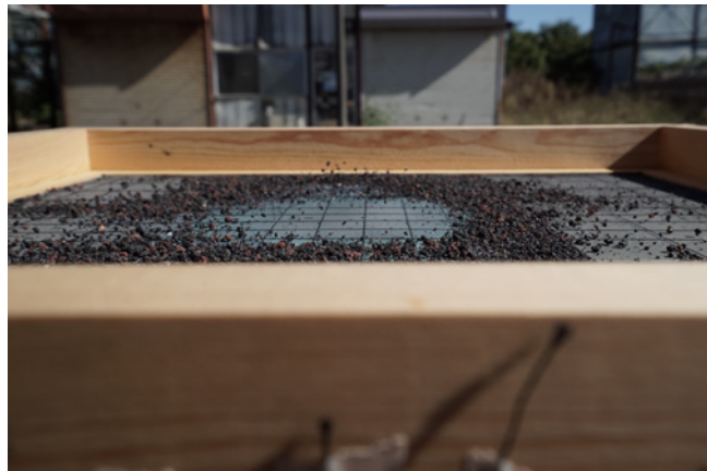
Production scene : The Sun and Mt. Fuji and Steve Reich , 2016